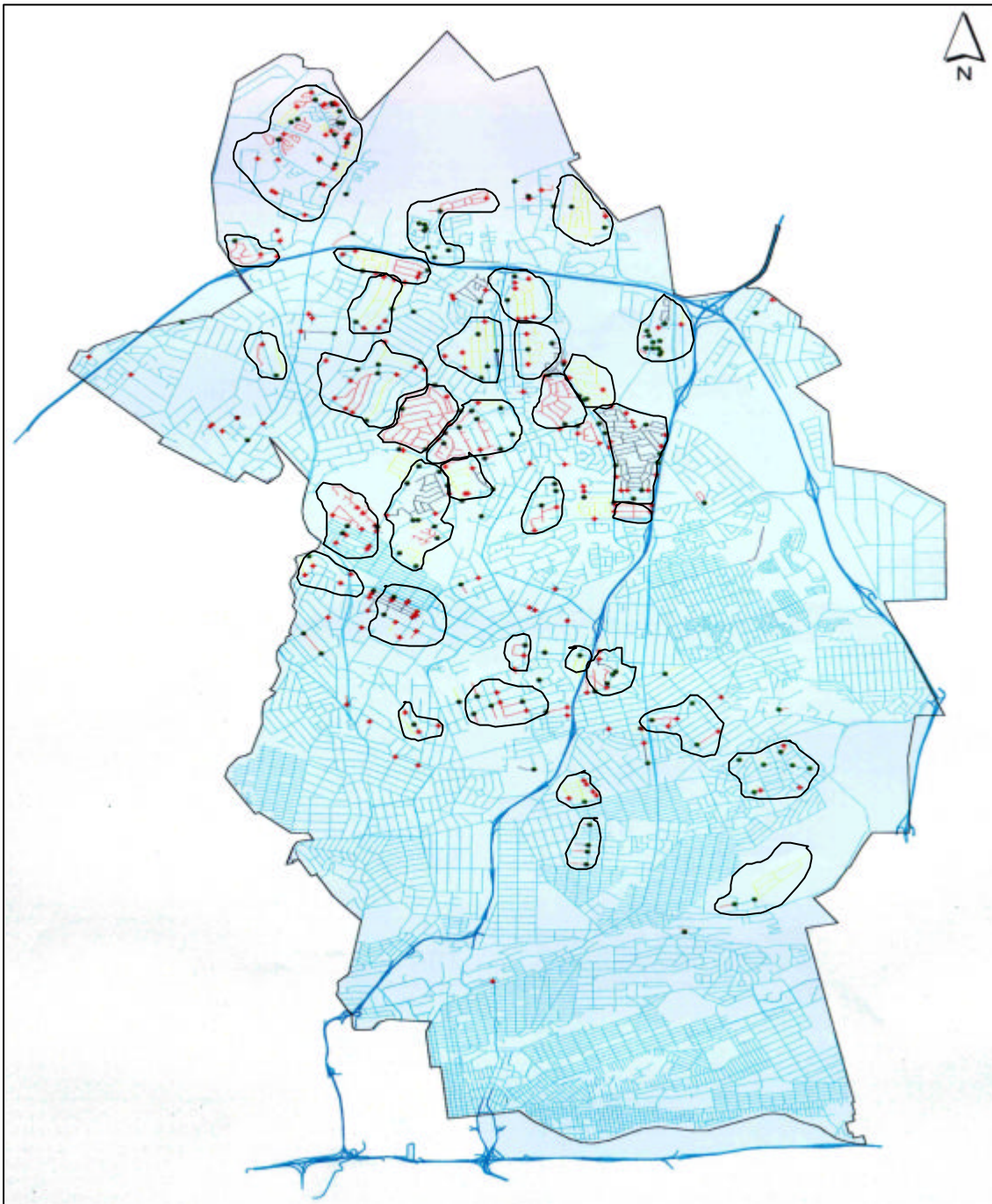
Figure 3: Map of the Eastern Metropolitan Local Council showing a number of enclosures scattered over the area. (Original map done by MBS Consulting Engineers, Johannesburg).

mentality of taking care only of themselves and their immediate neighbours. This reflects a stance of social exclusion (Landman 2000b).