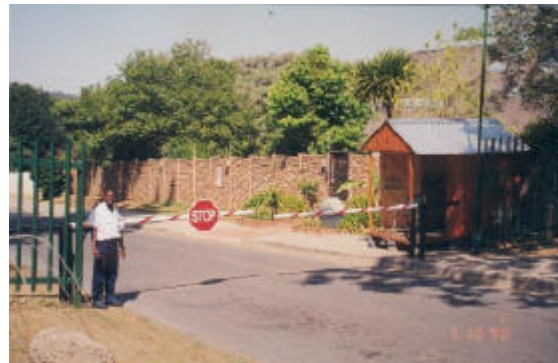
Figure 2: An enclosed neighbourhood in Johannesburg protected by a security guard controlling access into the area. Cars are stopped and the details of persons in the cars are requested and kept on record.

“Enclosed neighbourhoods refer to neighbourhoods that have controlled access through gates or booms across existing roads. Many are fenced or walled off as well, with a limited number of controlled entrances/exits and security guards at these points in some cases. The roads within these neighbourhoods were previously, or still are public property and in many cases the local council is still responsible for public services to the community within. An enclosed neighbourhood usually refers to an existing neighbourhood that has been closed off” (Landman 2000b:3).