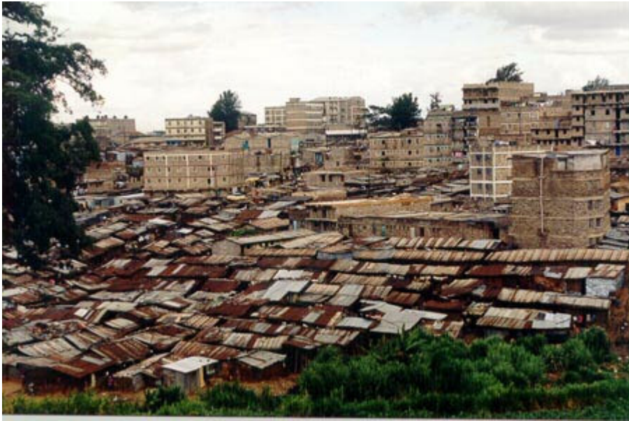
Figure 1 Informal settlements in a valley in Nairobi.