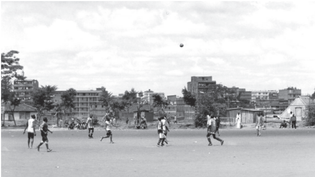
Nairobi, Kenya: © UN-HABITAT

This section has outlined the ways in which local governments in a number of countries in Africa have begun to meet the challenges of urban youth at risk, have been successful in working in a strategic way, and developing integrated comprehensive partnerships across municipal institutions and with civil society. The following section looks at the role of the international community.