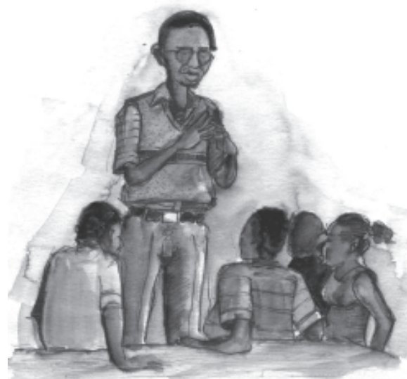
Nairobi, Kenya: © Kanyua/UN-HABITAT

youth - young people whose background places them 'at risk' of future offending and victimisation. There is already a huge increase in youth crime and deviance among young people in the region. The concern here is with the serious impact of recent global and regional trends on the most vulnerable young people and the communities in which they live, and on their capacity to participate in their own societies and be included, productive, and fulfilled citizens.