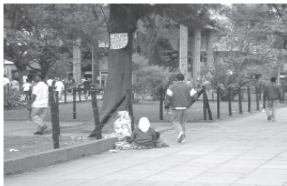
Nairobi, Kenya: © Jimmy Shamoony/UN-HABITAT

In such settings there is a thin line between what is legal and what is illegal. It is in this precarious environment that the majority of African youths are socialised, and many do not have a family member with a contract or steady salary in the last two generations. Poverty similarly limits access to education, and impacts the health of children and young people. Poverty has always been associated with forms of social exclusion – exclusion from the benefits of good services and quality of life, from access to power and decision-making - but the huge increases in the numbers of urban poor mean that far higher proportions of urban youth are now subject to such social exclusion.