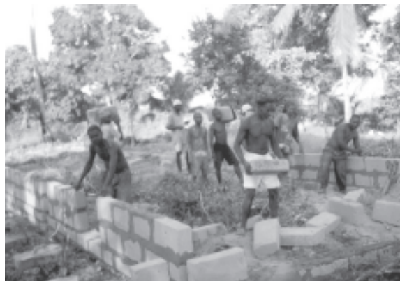
Dar es Salaam, Tanzania

This project provides work for 97 unemployed and poor youth in the Kitunda ward, one of 22 wards in the Ilala municipality. The population of 10,000 lives in unplanned settlements with little infrastructure or social services. Some 90% of