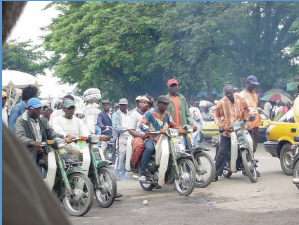
Douala, Cameroon: © Vincent Kitio/UN-HABITAT