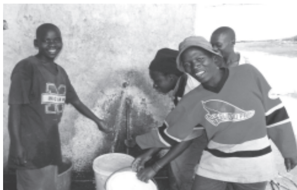
Nairobi, Kenya: © UN-HABITAT

This strategy paper has been developed in the context of UN-Habitat's Safer Cities Programme, and the New Partnership for Africa's Development (NEPAD). It forms part of UN-Habitat's work on urbanization, the inclusive city, the problems of urban youth, and issues of governance and youth participation. It is in keeping with the Millennium Development Goal of achieving a significant improvement in the lives of urban slum dwellers by 2020.