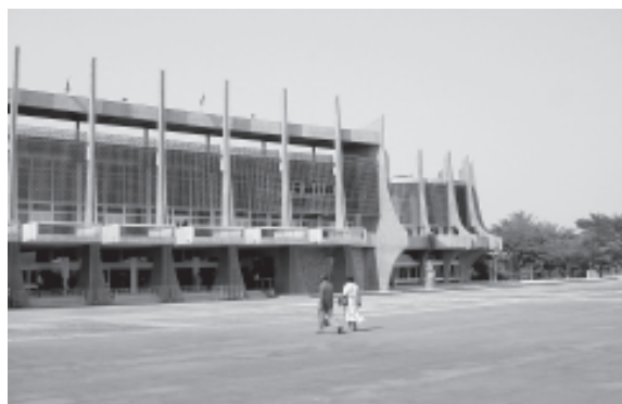
Yauonde: © Laura/UN-HABITAT

comprehensive national and urban policies which pay specific attention to the needs of children and youth, is also essential. Finally, it is important to realize the potential of youth themselves, and to engage their participation in the development of appropriate responses and solutions.