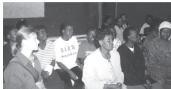
Nairobi, Kenya: © UN-HABITAT

Young people in Africa are among those most affected by HIV/AIDS. Worldwide, an estimated 11.8 million young people aged 15 to 24 are living with HIV/AIDS of which 8,600,000 are living in sub-Saharan Africa. 92 It is estimated that half a million African youth aged 15 to 24 will die from AIDS by 2005. 93 In Botswana, South Africa and Zimbabwe, it is estimated that more than 60 per cent of boys aged 15 today will become infected with HIV during their lifetime. 94 The situation for young women is even worse. In one city in South Africa, six out of 10 women aged 20 to 25, were HIV infected; among youth in their early 20's, women's infection rates were three times higher than men's. In Kenya, nearly one teenage woman in four is living with HIV, compared to one in 25 teenage males. 95