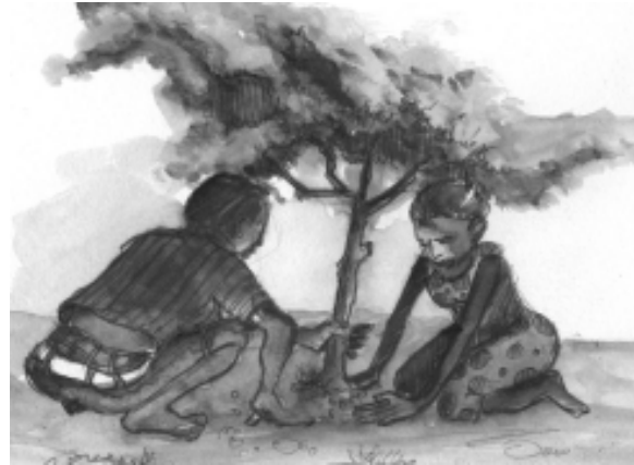
Nairobi, Kenya

With their exposure to the extremes of violence often reported, child soldiers are likely to suffer very serious physical, psychological and sexual harm. Overcoming the effects of those experiences, as well as dislocation from families and communities of origin, and loss of traditional education and socialization, and integrating back into the community, presents huge challenges. Governments who fail to acknowledge the participation of children as fighters, and exclude them from benefits have not always recognized their needs. Many other children and youth have also been affected by the impact of war on their families and communities, and the destruction and dislocation which has resulted.