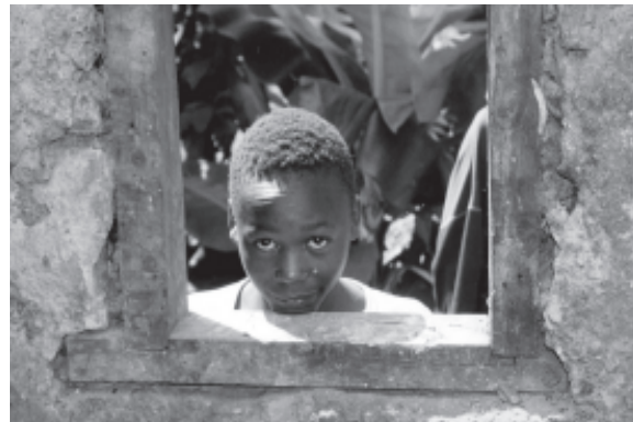
Nairobi, Kenya: © Justo/UN-HABITAT

The behaviour of young people in many African cities often fluctuates between survival strategies and risk taking. 75 Street children - those with disrupted or no family ties, who survive in urban areas on the streets - form the most tragic and extreme examples of social exclusion, and risky behaviour. 76 They are one of the fastest growing problems in Africa (as well as other