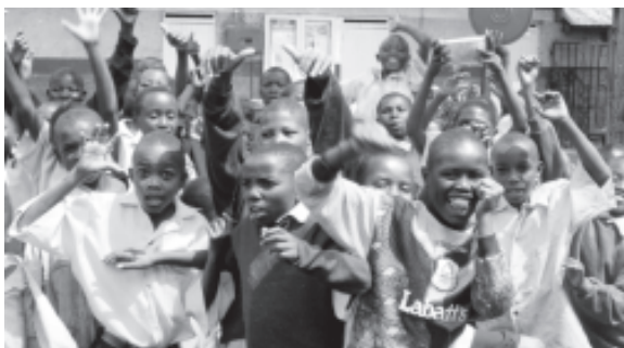
Nairobi, Kenya: © Sabine/ UN-HABITAT

Many of those living in informal settlements do not even enter primary education, because families cannot afford it, or lack of schools. Others never progress beyond primary level, again for reasons of cost as well as the availability of secondary education. Yet others leave school early, under pressure from families to earn money or provide family care. This increases their vulnerability to crime and victimization, and further reduces their opportunities to find productive work and involvement in their society.