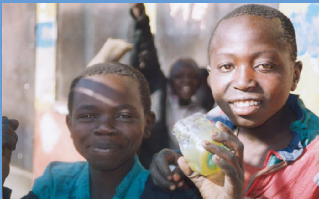
Nairobi, Kenya: © UN-HABITAT