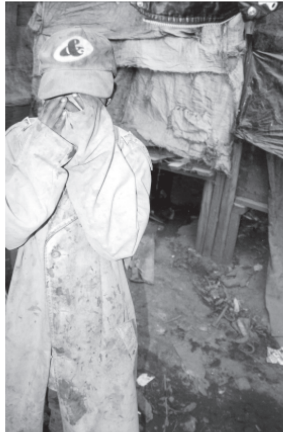
Nairobi, Kenya: © Justo/ UN-HABITAT

aged 15 to 24. 47 Every day, about 1,700 children become infected with HIV. There are an estimated 2.1 million children worldwide under age 15 currently living with HIV. In 2003, about 630,000 children under the age of 15 became infected. 48 About 1.7 million new