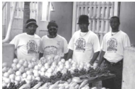
Durban, South africa: © Ismail/UN-HABITAT

A community safety diagnosis helps to identify the locations, neighbourhoods, groups and individuals involved in or affected by specific problems. This can include the use of surveys of victimization and needs, and surveys carried out by youth themselves. The partnership also needs to be involved in the development of a plan of action for tackling the problems identified and deciding on the priorities for action. Each priority action may involve a different set of partners. A substance abuse prevention project may include health officials, drug counsellors, teachers, police, prosecutors, judges, and community organizations specializing in drug rehabilitation, for example, and a programme to address school violence in schools, education administrators, teachers, parent associations, student organizations, social mediators, the police and local businesses. For every problem there will be an appropriate partnership, and the permanent support team helps to guide and co-ordinate partnership activity. Implementation of the action plan needs to be regularly monitored and evaluated to ensure that the goals and objectives of the plan are being met.