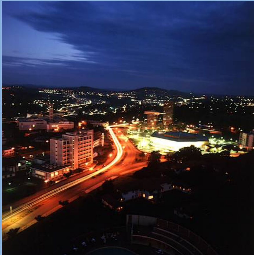
Yaounde, Cameroon: © UN-HABITAT