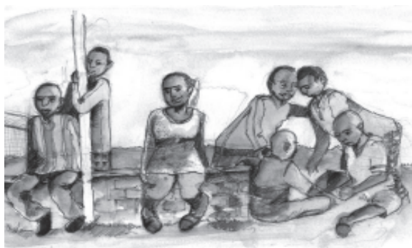
Nairobi, Kenya: © Kanyua/UN-HABITAT

The most vulnerable urban youth in Africa include a number of often over-lapping groups who face the greatest risks - those already involved in the justice system - and those on its margins. 'At risk' youth in urban settings include all those girls and boys, young women and men, whose living conditions, health and circumstances or behaviours place them at risk of victimization and/or involvement in crime. They include youth already in conflict with the law, those living in urban slums, street children, youth gangs, school-drop outs, unemployed youth, substance abusing youth, those who are sexually exploited and war-affected children, and those affected by the HIV/AIDS pandemic, including orphans.