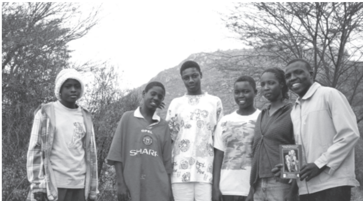
Nairobi, Kenya: © UN-HABITAT

This section has outlined the challenges facing youth in African cities. The specific case of youth at risk is discussed in the next section.