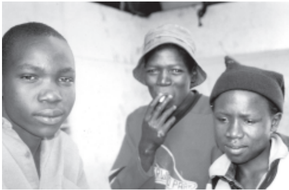
Nairobi, Kenya

Internationally, a number of terms are used to refer to young people. The term youth is often defined as those between the ages of 15 and 24, young people those of 10-24, adolescents 10-19 year-olds, and children, those under 10. 6 Countries and regions have many different conventions. In Africa, it is common to define young people as those up to 35 years of age, and to include those under 10. In general, follows the international conventions where data exists, and uses some of these terms interchangeably. It focuses mainly on youth of 15-24.