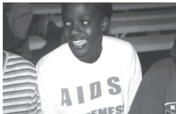
Nairobi, Kenya: © UN-HABITAT

UNICEF 2002 Young People and HIV/AIDS: Opportunity in Crisis