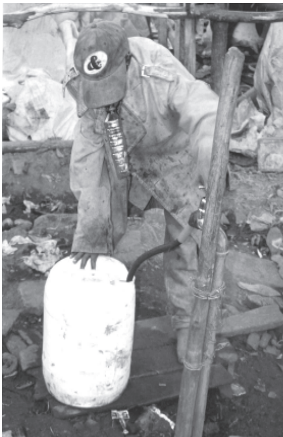
Nairobi, Kenya: © Justo/ UN-HABITAT

of a formal education. 41 Child labour also increases the risks of exposure to illegal activities such as prostitution or drug trafficking, and increases the risk of AIDS especially among girls. Finally, close family ties are essential for children, but child labour often inhibits regular contact with family members, because of distances and transport costs. Coupled with exploitative working conditions, these problems can transform child workers into street children.