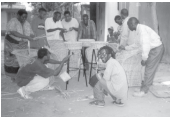
Dar es Salaam, Tanzania: © UN-HABITAT

behaviour. The police and the courts are two facets of the criminal justice system which can play a major role in reducing the marginalisation of youth at risk, as well as in their rehabilitation. 121 A corrupt or inefficient police and justice system encourages calls for tough responses and vigilante justice, and affects the extent to which youth at risk trust state institutions, and can be expected to abide by laws and policies.