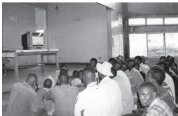
Nairobi, Kenya: © UN-HABITAT

The situation of youth at risk in Africa is acute. While youth in many parts of the world, especially in developing countries, are confronted with severe problems, it is clear that African youth are especially vulnerable. Cities in Africa include some of the world's poorest and most overcrowded urban environments. The lives of young people in Sub Saharan Africa, in particular, are marked by a combination of severe human injustices and disasters.