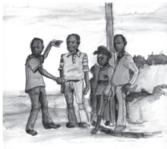
Nairobi, Kenya: © Kanyua/UN-HABITAT

Gangs and groups of young people engaging in delinquent or criminal behaviour are found in most countries. The great majority are male, and in most cases they are in a transition stage. Their formation is often a reaction to exclusion and marginalization in society, and they serve to provide alternative legitimacy and support. They offer acceptance, status, identity and social and recreational opportunities, as well as economic gain. They range from loose social or friendship groups – youths who hangout together - to more organized and structured gangs engaging in unlawful acts such as 'taxing', fighting rival groups, drug dealing or violent crime and intimidation. The latter often have a common style of dress, codes of conduct and language. Gangs of street children, on the other hand, are rather different, since their primary aim is survival, not crime.