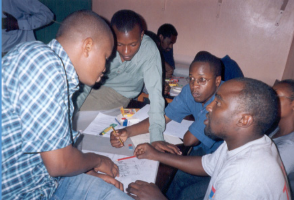
Nairobi, Kenya: © UN-HABITAT