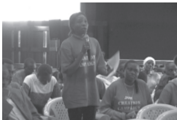
Nairobi, Kenya

The Malindi Youth Consultative Committee (MYCC) was launched in September 2002 (Malindi Youth Day) by the Mayor and Municipal Council. Youth showcased their activities at the ward level, which was sponsored by USAID and cash awards were given to the three best wards. The MYCC has an elected youth representative from each of the 12 wards and its Secretariat includes the Junior Mayor, 2 Vice Chairmen, a Secretary and a Treasurer. The Steering Committee representing businesses, municipality, central government, religious and community leaders and MYCC provides guidance to the youth and city consultation process.