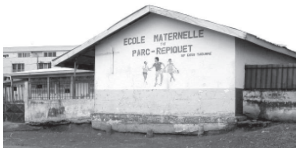
Yaounde, Cameroon: © Laura/UN-HABITAT

day. 28 The main causes of death and stunted growth are malnutrition and disease, both very prevalent in Africa. In Accra, for example, the majority of those under 15 years die from infectious and parasitic diseases. In Egypt, 25% of those under five years have stunted growth, compared to two percent in the USA. Child malnutrition is rapidly shifting from rural to urban areas. 29 The physical hazards for children and youth living in overcrowded slum areas are also high. In Ibadan, Nigeria 1,236 injuries involving 436 children were recorded over a three-month period, and less than 1% were treated in formal health facilities. In Kaduna Nigeria, 92% of children examined had blood lead levels above acceptable limits. 30